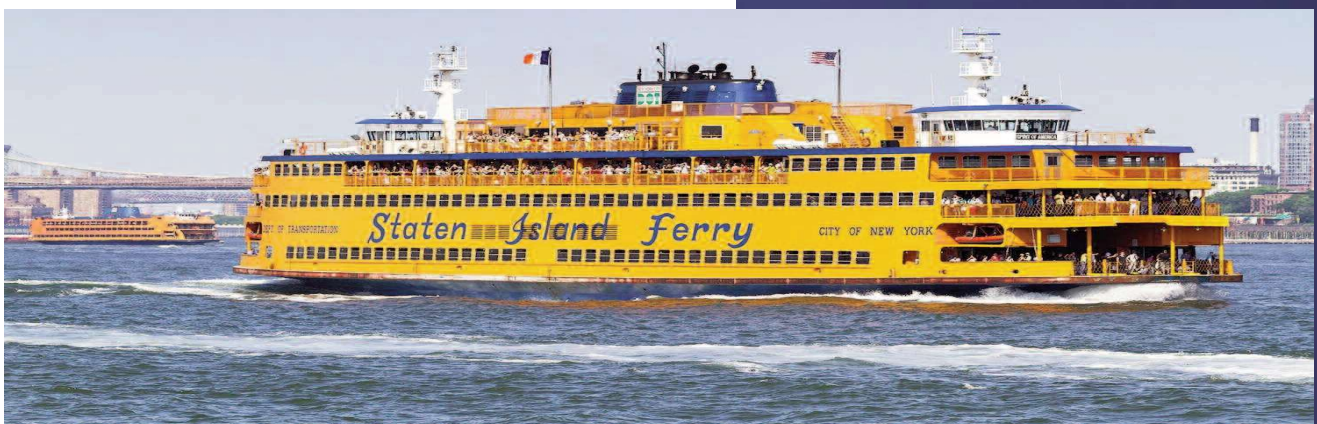
New York City Staten Island Ferry, Spirit of America, equipped with Thordon Water Quality Package and COMPAC seawater lubricated propeller shaft bearings.